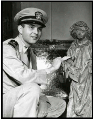
Craig Hugh Smyth (1915 – 2006)